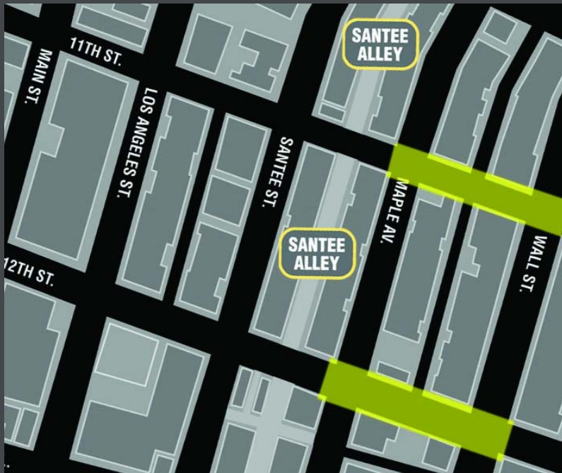
Construction areas are along 11th and 12th Streets, from Maple Avenue to Wall Street (highlighted in yellow).

E leventh and Twelfth Streets, between Maple Avenue and Wall Street will undergo construction in order to replace storm drains. Work will take place at nighttime and should not affect business. The City of Los Angeles Department of Public Works will conduct the construction of a storm drain system comprised of 850-foot, 24-inch pipes along the designated area. Work will also include construction of catch basins, lateral pipes, maintenance holes and transition/junction structures.